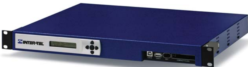
CS-5400 Communications Server

The Inter-Tel CS-5400 communication server is designed for the larger customer requiring up to 110 IP endpoints. The Inter-Tel CS-5400 is built on an Inter-Tel CS-5200 through an upgraded processor expansion card that is installed in the dedicated processor bay.