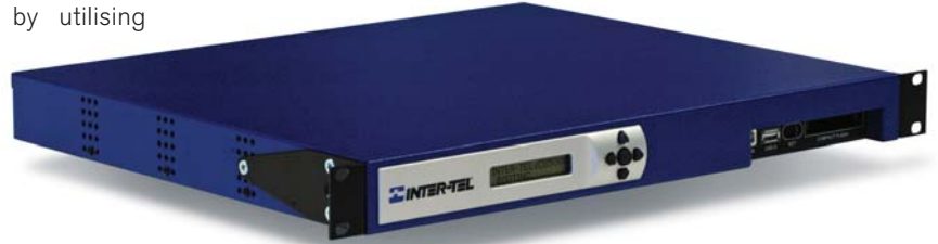
CS-5200 Communications Server

In today's competitive business environment you understand the need to optimise the performance of your organisation by utilising technology that allows you to operate more effectively. Voice over IP (VoIP) can add value to your organisation, and with Inter-Tel's latest product offering you have a system that considers your unique business requirements, allowing you to deploy VoIP technology efficiently, effectively and successfully.