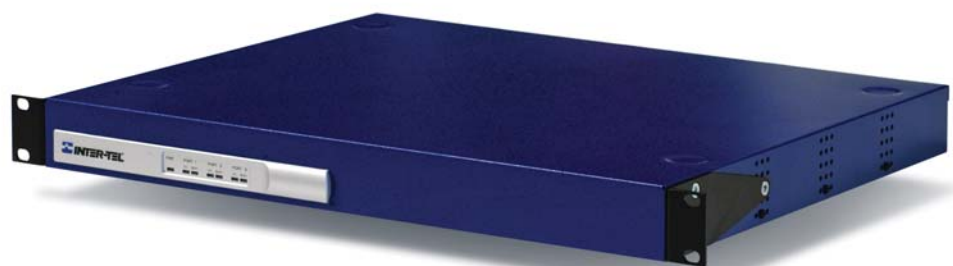
DE-5200 Communications Server