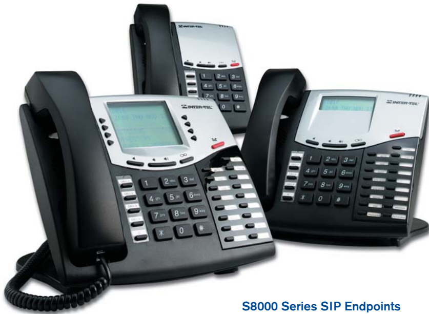
S8000 Series SIP Endpoints